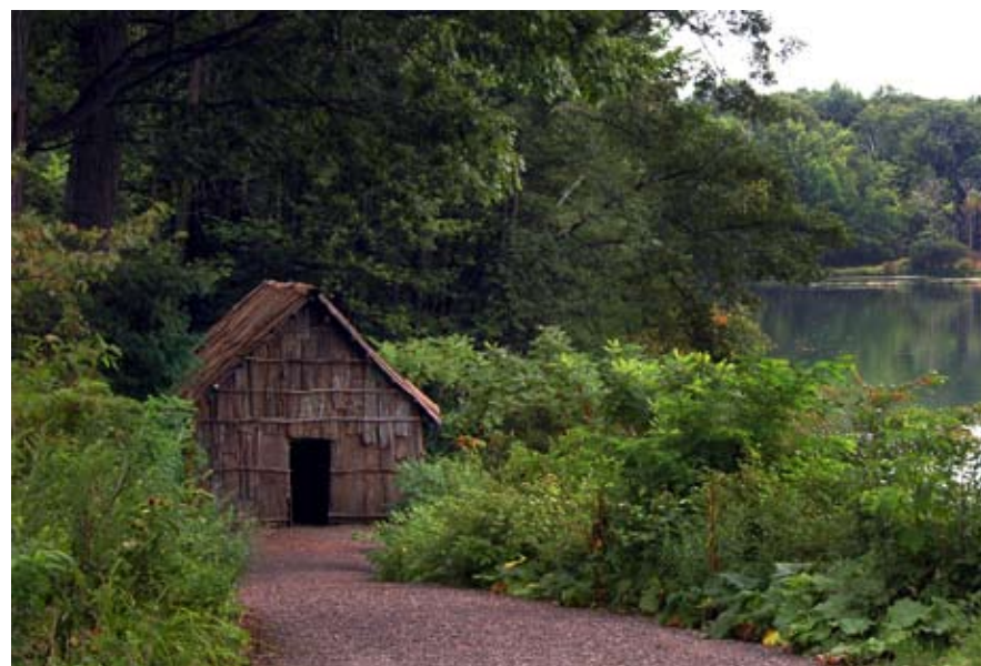
The Mohawk Bark House on the shore of Otsego Lake, will soon be accessible by a new Interpretive Trail .

The histories of The New York State Historical Association and the Fenimore Art Museum are quite vast. Words can explain and summarize specific events that have led these institutions to their current place in time, but words cannot fully describe the discreet connections that relate those events. The new Interpretive Trail , opening Memorial Day weekend at the Fenimore Art Museum, creates an inviting way to explain these connections - all on a stately, scenic path.