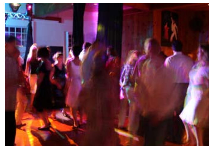
Guests enjoyed the 'Studio 54' dancing at the New York State themed gala in 2008.

Proceeds from the 2009 gala will support educational